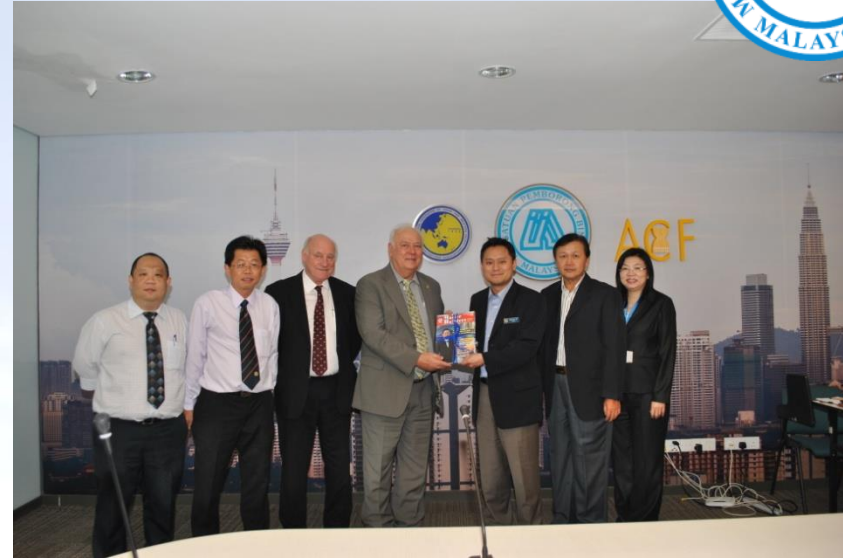
President of Chartered Institute of Civil Engineering Surveyor UK