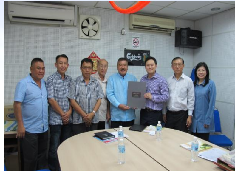
Dialogue with Kelantan Builders Association