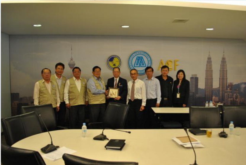
Dialogue with Sabah Builders Association