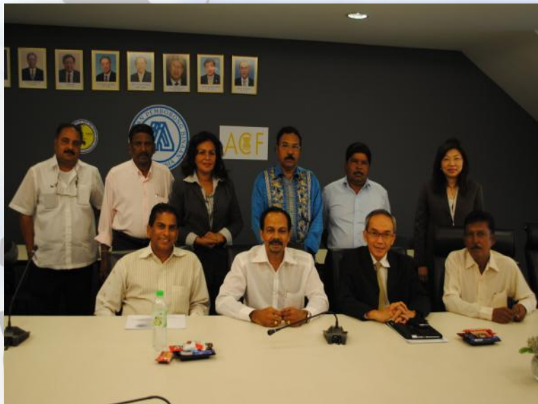
Dialogue with PKIM