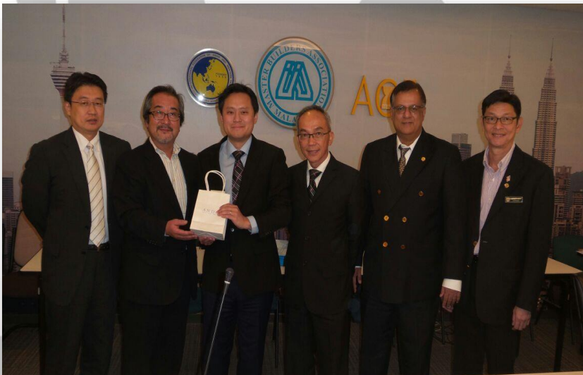
Visit by The Overseas Construction Association of Japan Inc. (OCAJI)