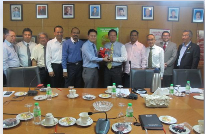
Dialogue with PKMM