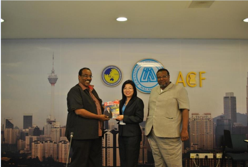
Sudan Contractors Association