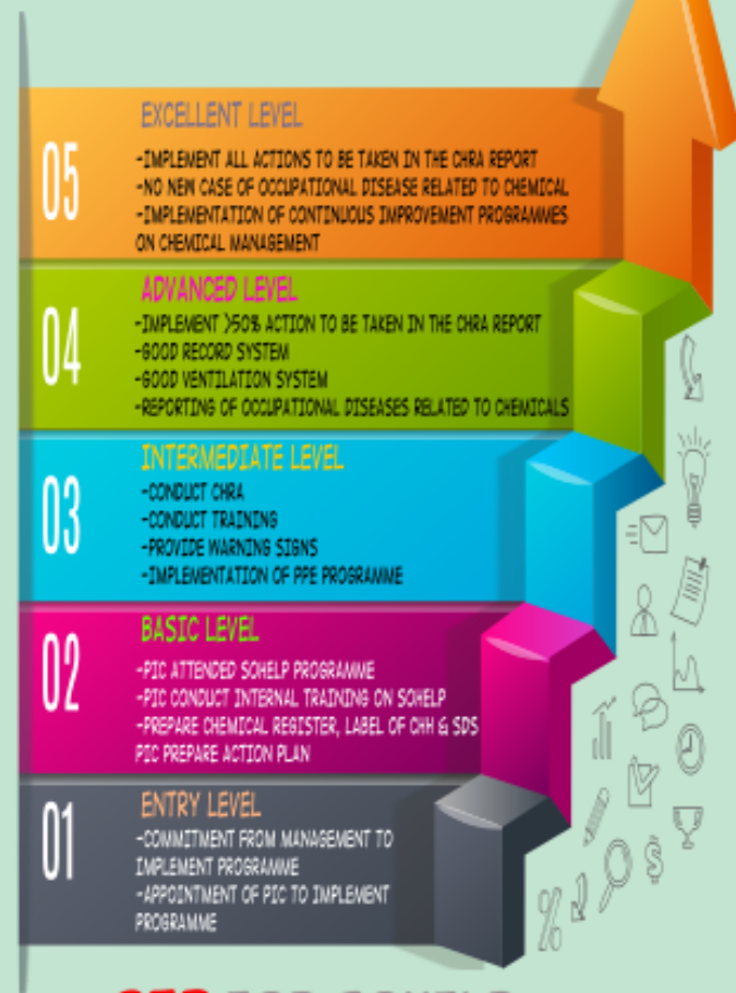
CEP FOR SOHELP