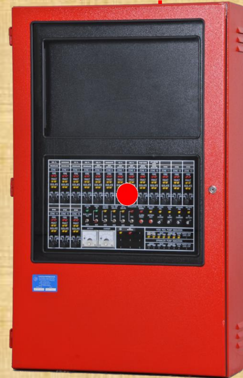
Fire Control Panel