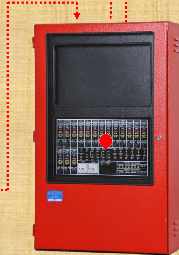
Fire Control Panel